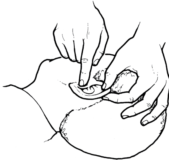
Rubbing ear to help drug flow to inside of ear.