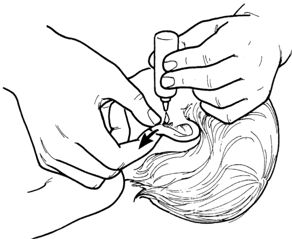
Hand and dropper position for children 3 years old and younger with earlobe pulled down and back.