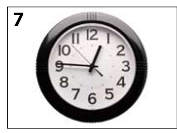
If your child needs to take another puff of medicine, wait 1 minute. After 1 minute repeat steps 3–6.